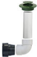
INSTALL POP-UP EMITTER

Connect the drain pipe exiting the Flo-Well to an elbow with a weep hole. The elbow should be installed with the weep hole on the horizontal side of the elbow. Slide the Pop-up Emitter onto the elbow. An additional length of pipe can be used between the elbow and Pop-Up Emitter to bring the Pop-up emitter to the surface. The Pop-Up Emitter fits on the "bell" or "hub" end of the pipe or a pipe coupler.