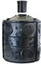
CONNECT FLO-WELL SURFACE INLET

Knock out the center hole of the Flo-Well lid. Place the lid on the Flo-Well side panels then place the Flo-Well Surface Inlet onto the Flo-Well lid.