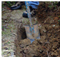
LAY OUT SYSTEM, DIG TRENCHES AND HOLES

Dig holes and trench for drain pipe and Flo-Well. Dry fit (no glue) the entire drainage system from the Flo-Well to the pop-up emitter. The Flo-Well should be installed at least 10' away from any existing structure. Measure and cut all pipe to necessary lengths. After completing each step, glue parts together.