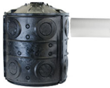
INSTALL FLO-WELL AND DRAIN PIPE

surfaces and use a hammer to knock out the holes in the side panels.